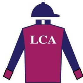
NIGHT AT THE RACES

We are pleased and proud – and thankful – to tell you that all horses and all sideboard numbers have been sold! We are ready for a great night at our annual Night at the Races SSO fundraiser. Both the dress down day and pizza party student prizes WILL be awarded. We'll be announcing a dress-down day for the entire school, as well as the winner of the class pizza party soon!